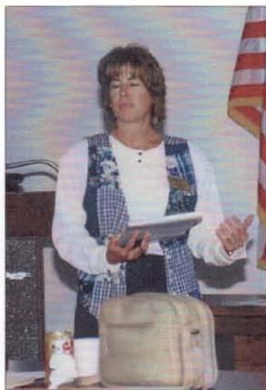
Marvene Riis, SD Archives