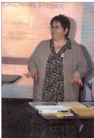
LaVera Rose, SD Archives